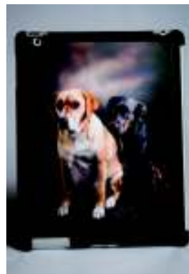
One image, snap on plastic case.