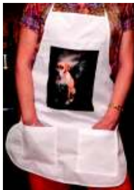
One size fits all. Polyester.