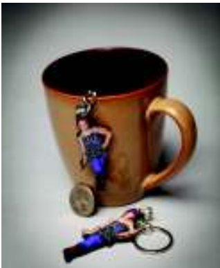
Set of TWO die-cut key chains. Thick, durable polymer material.

8X10 Team Portrait _____ $15 8x10 Individual Portrait _____ $15 5x7 Team Portrait _____ $12 5x7 Individual Portrait _____ $12 4x6 Individual Portrait _____ $10 Set of 4 Wallets _____ $10 Set of 8 Wallets _____ $15 Retouched individual image by email _____ $25 DieCut key chain (set of 2) _____ $16 Water Bottle _____ $18 Large Canvas Tote Bag _____ $25 Dance Magazine Cover _____ $18 Coffee Mug _ (11oz) $18 _ (15 oz) $20 Apron _____ $23 Ipad Case _____ $30 Key Chain _____ $12