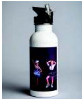
20 oz. white stainless steel with full wrap to include up to 2 images with name and year.