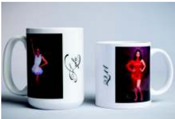
Available in 11 and 15 oz. sizes, double-sided to include two images plus name and year. Dishwasher and microwave safe.