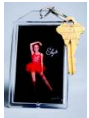
Double sided - 2" x 3" photos (with keyring).