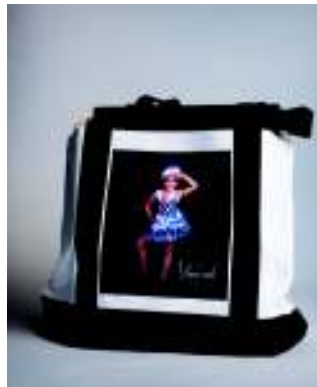
12x18 canvas bags with back pockets, black straps and bottoms.